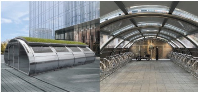
Reduced CO2 Footprint Solutions