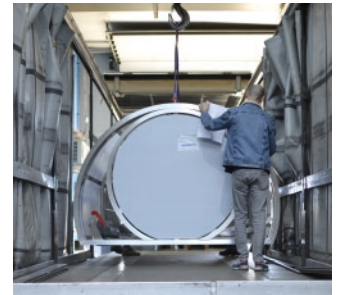
Optimized Packaging & Shipping