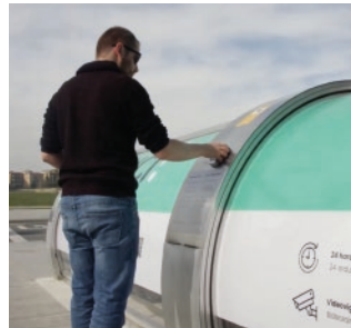
Compatible with Any Access Control